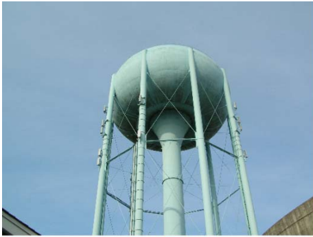
1.0 MG Elevated Water Tank

The Massapequa Water District will begin structural maintenance repairs on the 1.0 MG (Million Gallon) elevated storage tank located at May Place. The repairs are to maintain and upgrade the facility which provides a constant static pressure throughout the water system. The scope of the project will include detailed inspections of the tank, refurbishing of any deficient components and the restoration of the finished surface layer.